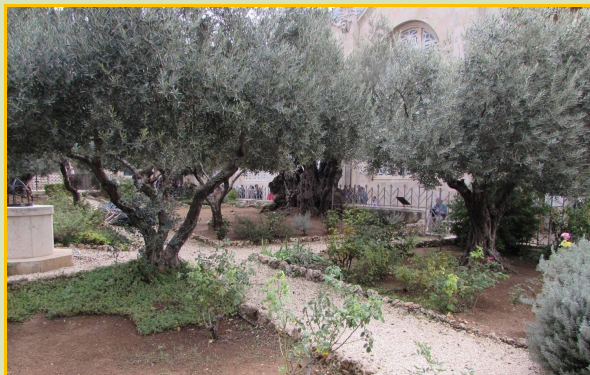
Join us for prayer in the Garden of Gethsemane.

Millions of tourists are now going to Israel. One of them could be you. It is safe. It is fun. It is a time of learning and worship.